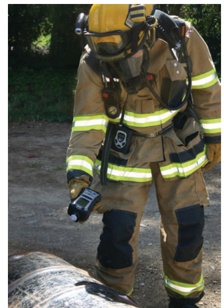
MultiRAE Pro with RAELink3 used for screening potentially hazardous drums