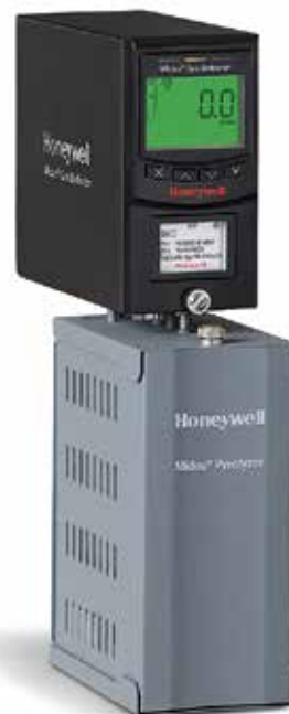
Midas Gas Detector with Midas Pyrolyzer